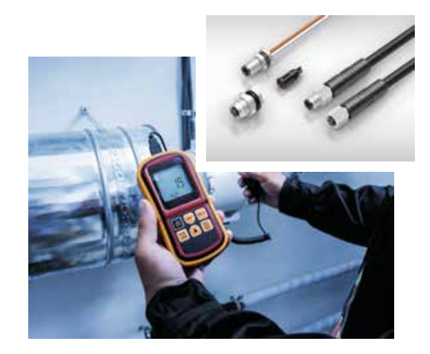
TEST AND MEASUREMENT